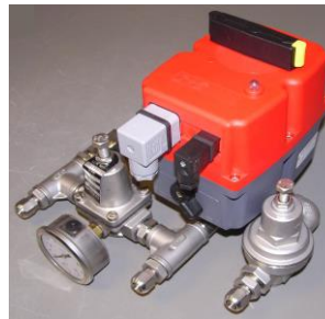
PRESSURE REGULATOR WITH ELECTRIC ACTUATOR