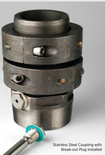
Stainless Steel Coupling with Break-out Plug Installed

Unlike rigid steel or plastic risers, BORELINE is supplied on a handy roll so is easy to deliver and to install in the most restricted of spaces – and, unlike mild steel risers, BORELINE will never rust through with the risk of losing your pump down the well.