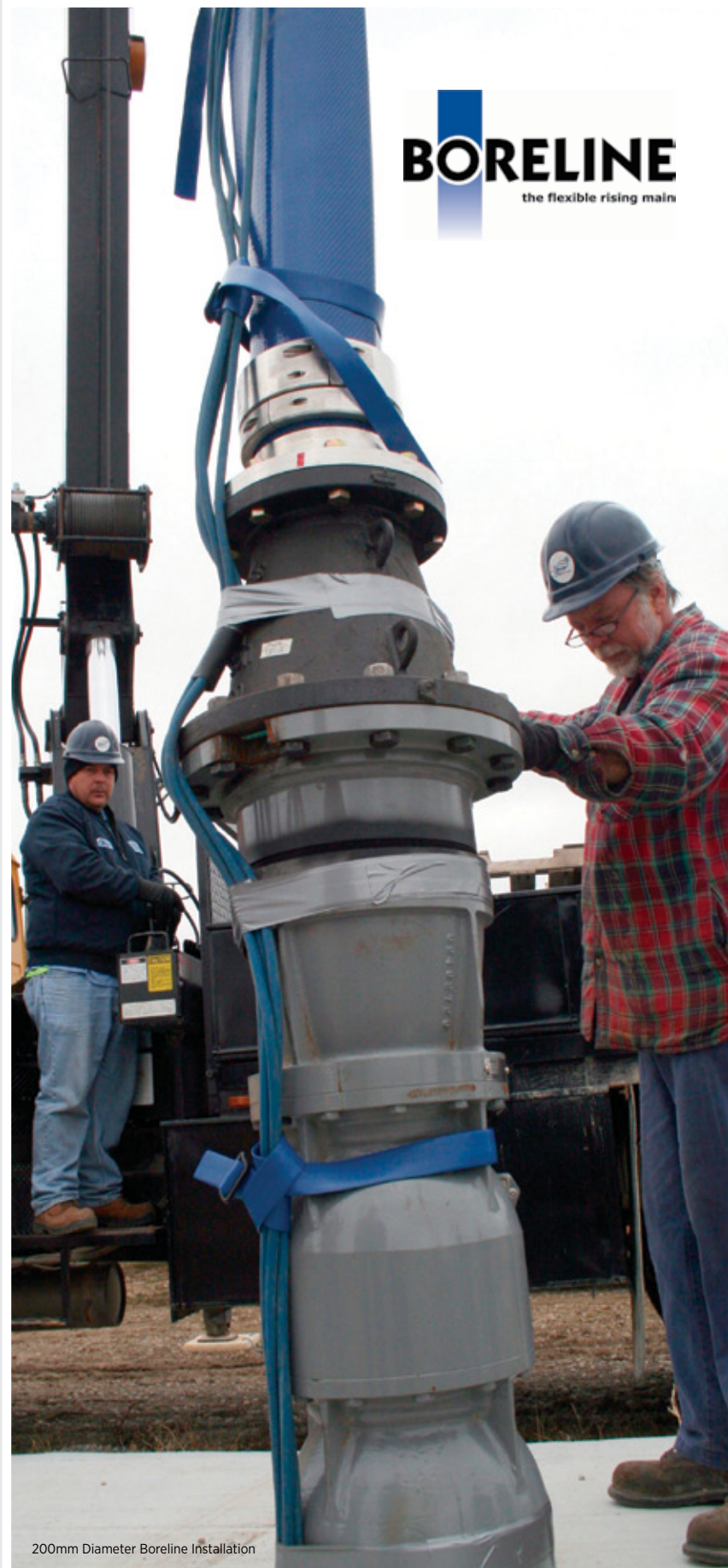
200mm Diameter Boreline Installation