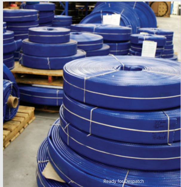
Ready for Despatch