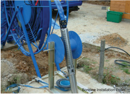
Boreline Installation Roller

BORELINE has a 5-year Warranty and all components are reusable which saves money when considering a pump maintenance schedule. Rigid risers, though, – whether rusty steel or cheaper poly-pipe systems – can be very awkward to dismantle when removed for servicing pumps and often require complete replacement.