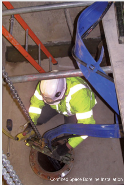
Confined Space Boreline Installation